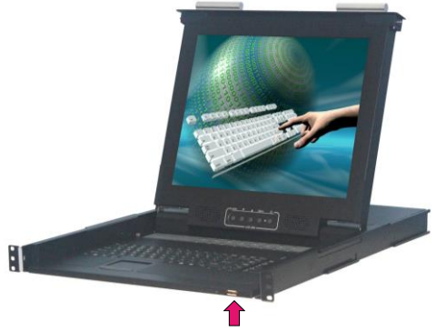
(USB Port for device access)

LCD console drawer provides a variety of features that simplify to access servers to making system monitoring, troubleshooting and software upgrades.